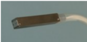
Model 6300-8 High Temperature Probe