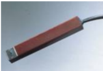
Model 6300-7 High Temperature Probe