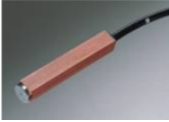
Model 6000B-16 probe