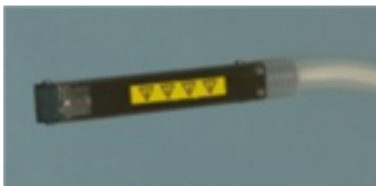
Model PD1216P probe