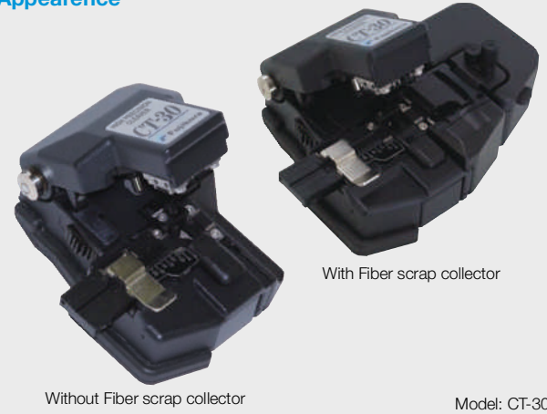
Without Fiber scrap collector