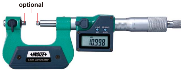
3581-25A (measuring tips are optional)