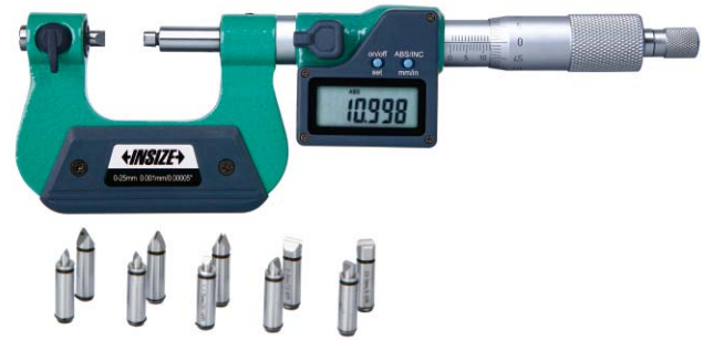
3581-S50 (measuring tips are included)