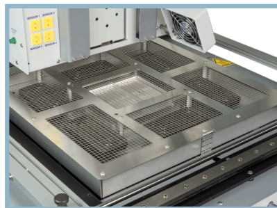
Height Adjustable Bottom Heater