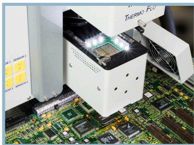
High-Definition Vision Overlay System